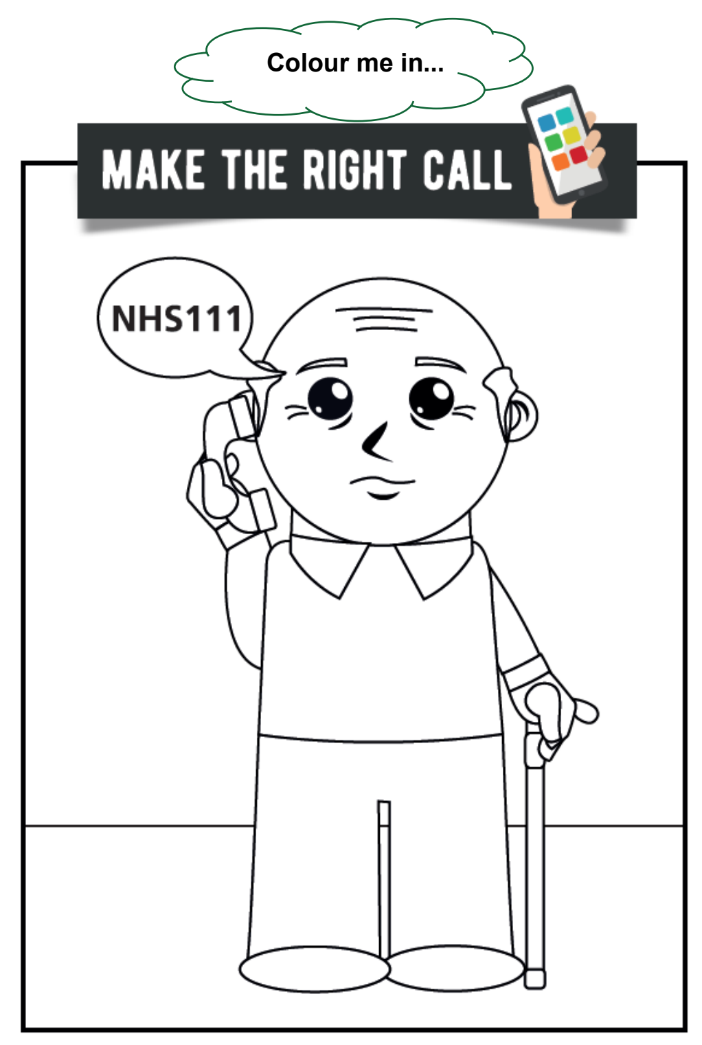
For more information visit www.maketherightcall.co.uk